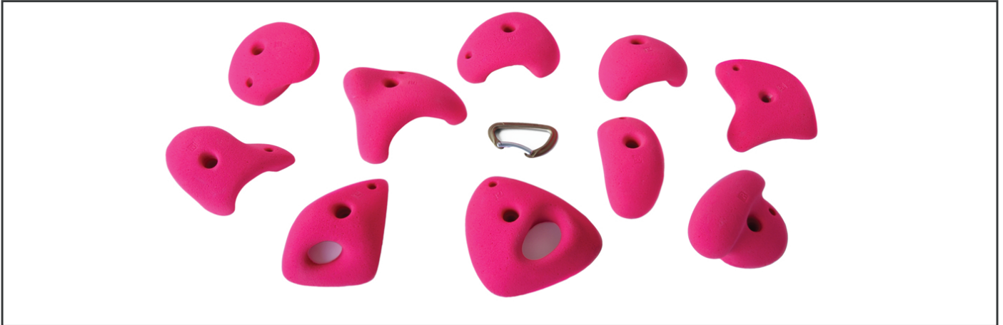
Ref. P1 (10 large holds)

A great range of general purpose holds with a wide variety of shapes in a range of sizes from positive jugs to finger edges, pockets, slopers and pinches. The durable but skin friendly texture makes these holds ideal for general use on any climbing wall.